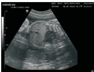
Fetus abdomen and ribs